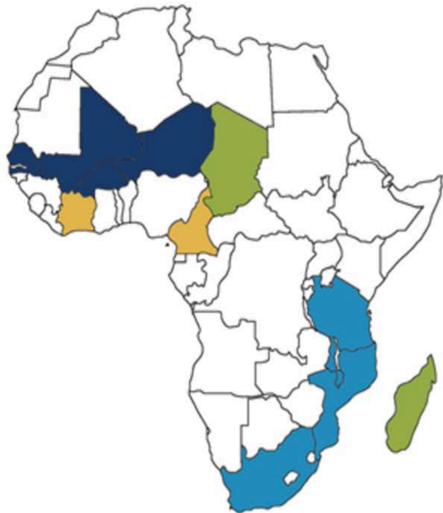
Map 1: state of GFCS Implementation in Africa as of December 2016.