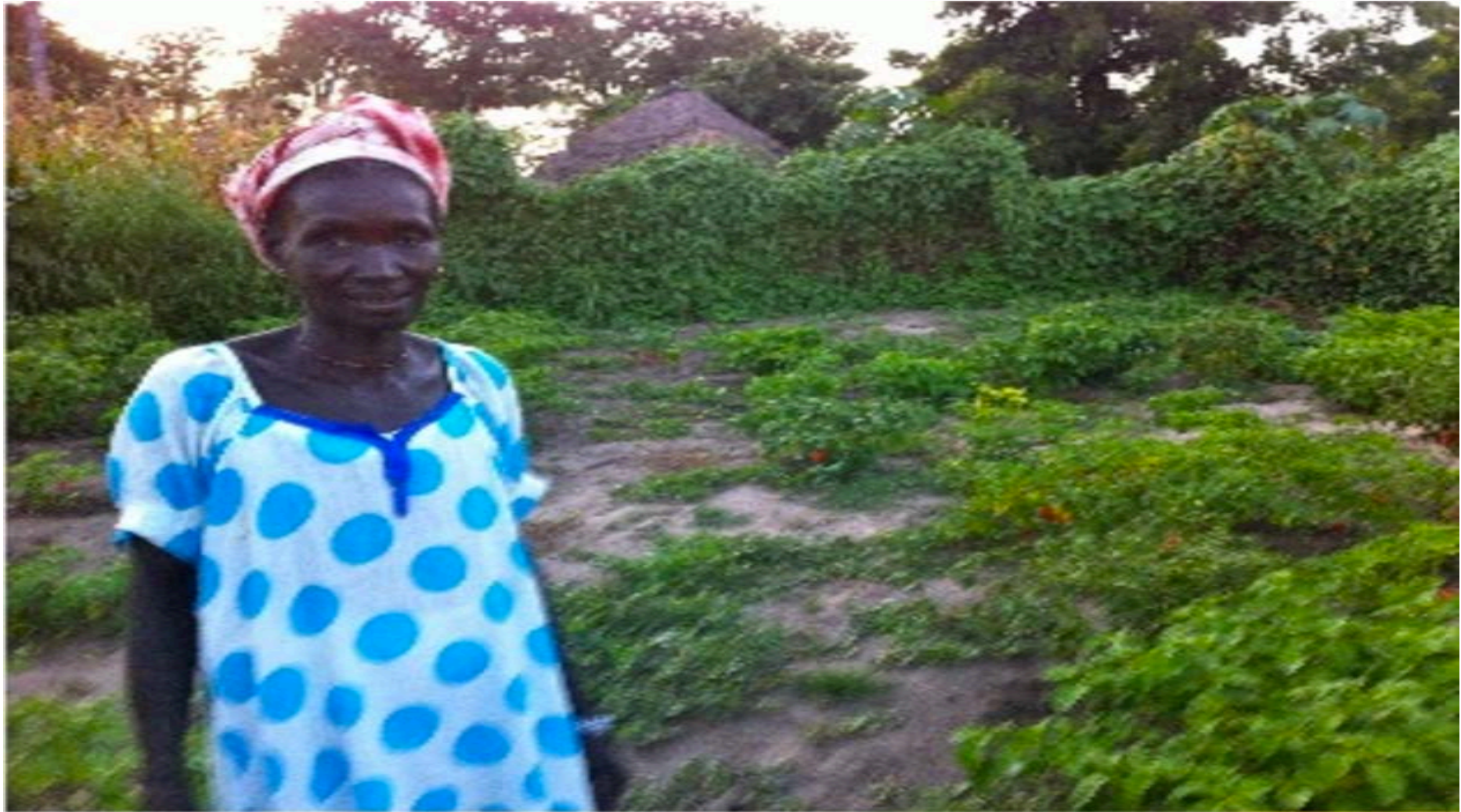
Emaciated Woman during Rainy season 2011 in Malem.